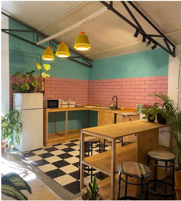
Communal kitchen - Designed & Built - 2026