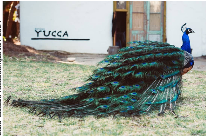
Zeca - Estúdio Yucca companion - 2021