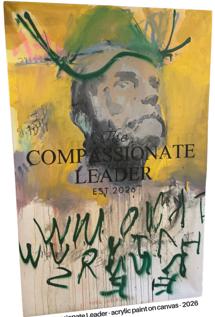
The Compassionate Leader - acrylic paint on canvas - 2026

Morality and The Compassionate Leader (2026) are companion works exploring the instability of contemporary leadership and the shifting values of modern society. Through layered imagery, expressive mark-making, and symbolic portraiture, the paintings question whether traditional structures of masculine authority still reflect compassion, morality, or human progress. Rather than offering certainty, the works invite reflection on power, vulnerability, and the social condition of our time.