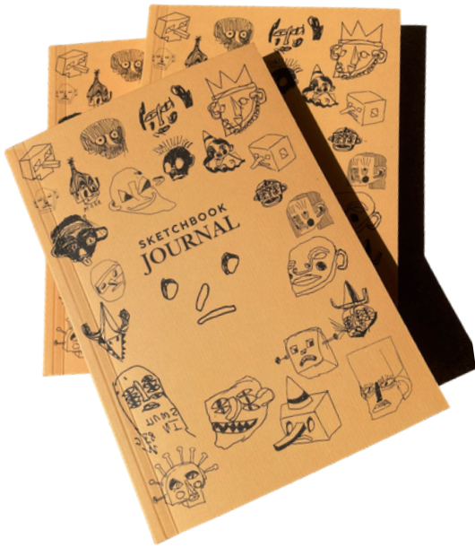
Sketchbooks - Designed for H.O.Z. - 2026

For a full list of products please contact via this link