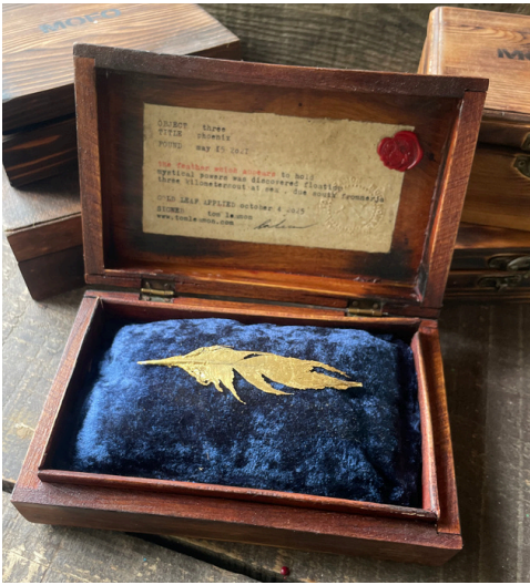
Box Three - Phoenix

The Museum Of Found Objects is a project I began back in 2024 but in all honesty an idea that I have considered for many years. Every week I take long walks normally in nature often on the Portuguese coastline always curious and paying attention to my surroundings. On these explorations, I find myself picking up objects that have been lost, discarded or are part of nature, objects usually considered to have no monetary value. Overtime these objects have filled up boxes and as I began to make sense of them I found myself cataloging each piece. This became the start of what is The Museum Of Found Objects. As I revisited items, I found myself drawn to certain pieces more than others and wanted to celebrate them in a new way, contradicting the notion that they were in some way worthless by gold leafing them and creating ornate boxes to house them in. Placing them on crushed velvet with a small description and date as to where and when they were found to in some way empower and bring new life to them whilst also highlighting our notions of value.