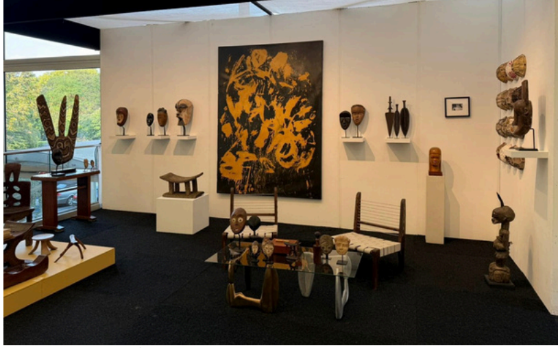
The Decorative Artfair London - with Ciprian Ilie - 2025