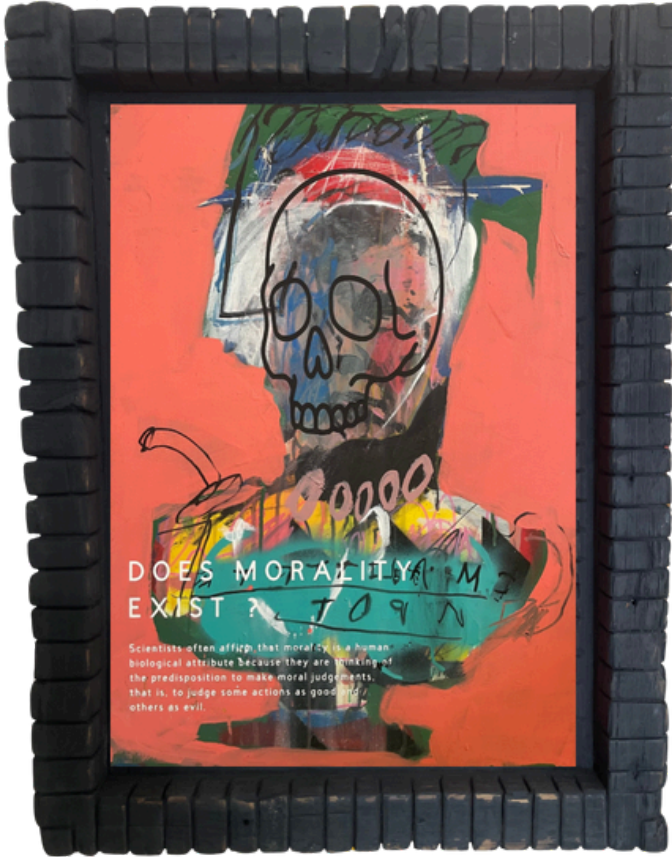
Morality - acrylic paint on canvas with handmade frame - 2026