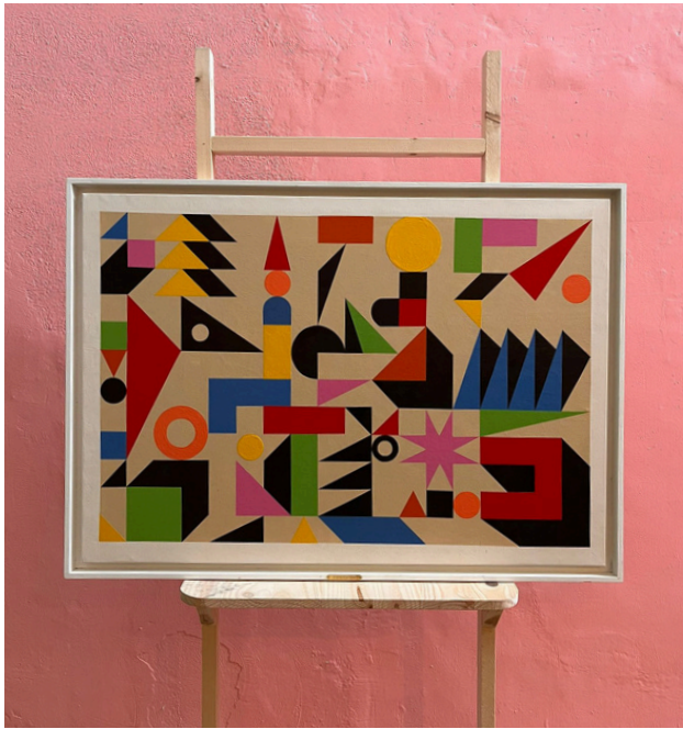
Birds Eye View - Acrylic Paint on Canvas - 2024 - Available