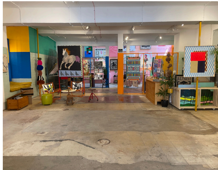
The Gallery - Co-designed and Built - 2026