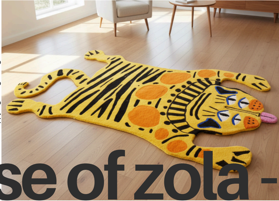
Happy Tiger Rug - Designed for H.O.Z. - 2026