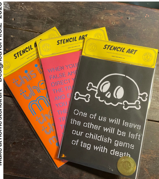
Make at home stencil art - Designed for H.O.Z. - 2026

Born from my studio practice and rooted in graffiti culture, House of Zola brings together rugs, prints, stencil cut-outs, sketchbooks, clothing, and handmade objects that invite people to participate, customise, create, and play. Some pieces arrive finished, while others are designed to be transformed by the person who owns them — painted on, drawn over, rearranged, or made personal. The project began from a simple desire: to create things with my daughter. Things we could make together. Things that felt fun, tactile, expressive, and alive. Objects that don't take themselves too seriously, but still carry care, craft, and artistic identity within them.