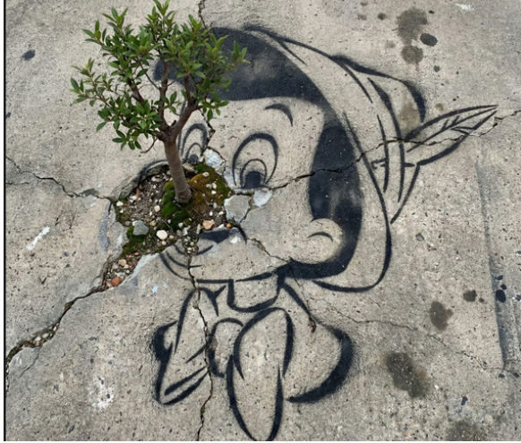
Street art stencil designed around nature - Tavira 2026