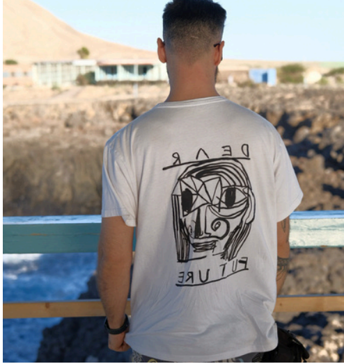
T-Shirts - Designed for H.O.Z - 2026