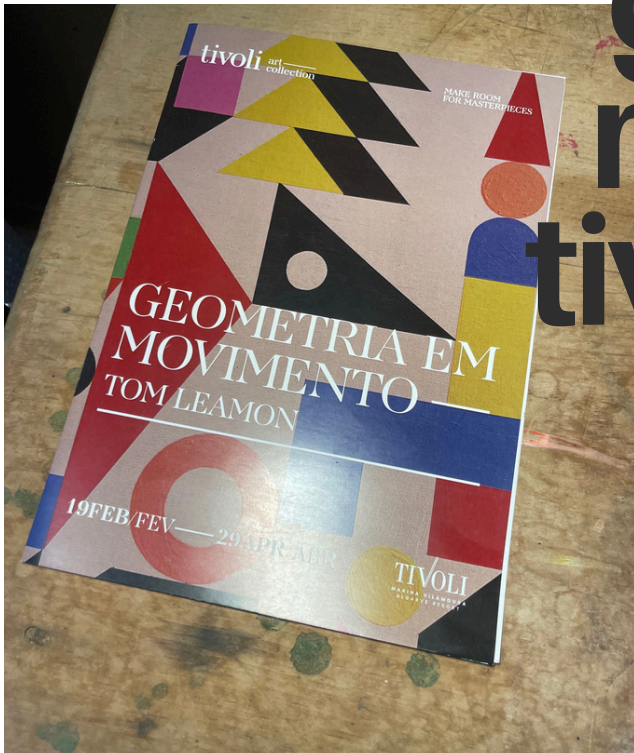
Exhibition Catalogue - Trivoli - 2026