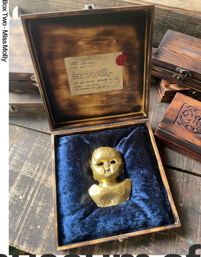
Box Two - Miss Molly