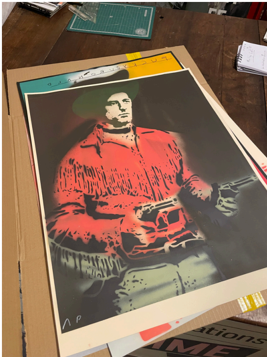
Stencil Art - Designed for H.O.Z - 2026

At its heart, House of Zola is about creativity as play — spontaneous, experimental, imperfect, and open to everyone. The collection is currently shown physically at Gama Rama, where my studio is based, with an online shop launching soon.