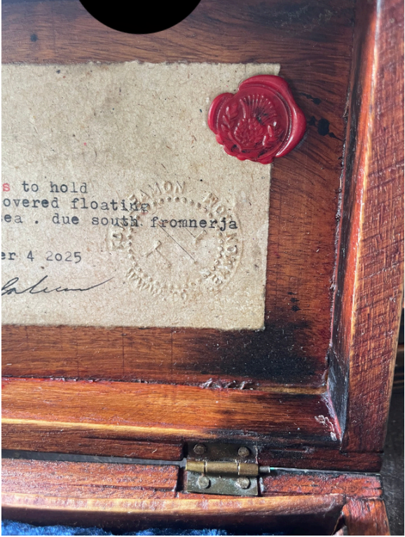
Close up of box detail