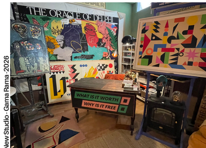
New Studio - Gama Rama - 2026

Nature became a way to disconnect from distraction and social pressure, returning instead to the slower cycles and realities of living that continue to ground and inspire my work. Yet extended solitude also forced a deeper engagement with myself — an experience that could feel equally healing and destabilising. The city, and the community surrounding Gama Rama, now offers a necessary counterbalance: human connection, dialogue, and creative exchange. Existing between these two spaces — isolation and community, introspection and interaction — has allowed me to find a renewed sense of balance, bringing clarity, energy, and purpose back into my practice.