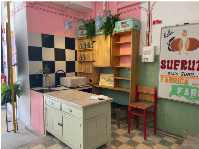
Entrance Bar - Designed and Built - 2026

One of the most exciting aspects of the project for me has been transforming the raw warehouse into a vibrant and welcoming creative ecosystem while preserving the spirit of the original building. I co-designed the layout of the space and helped develop its aesthetic identity, balancing playful use of colour with the industrial character of the old factory, retaining original tiles, flooring, and architectural details wherever possible. Today, GAMA RAMA is home to fourteen artist, exhibition and incubator spaces, an art shop workshops, and a growing community centred around artistic exchange and collaboration. Alongside Toma and Miguel, I help run the space collectively, and I continue to feel excited by its evolution as a place that nurtures art, ideas, and community in Faro.