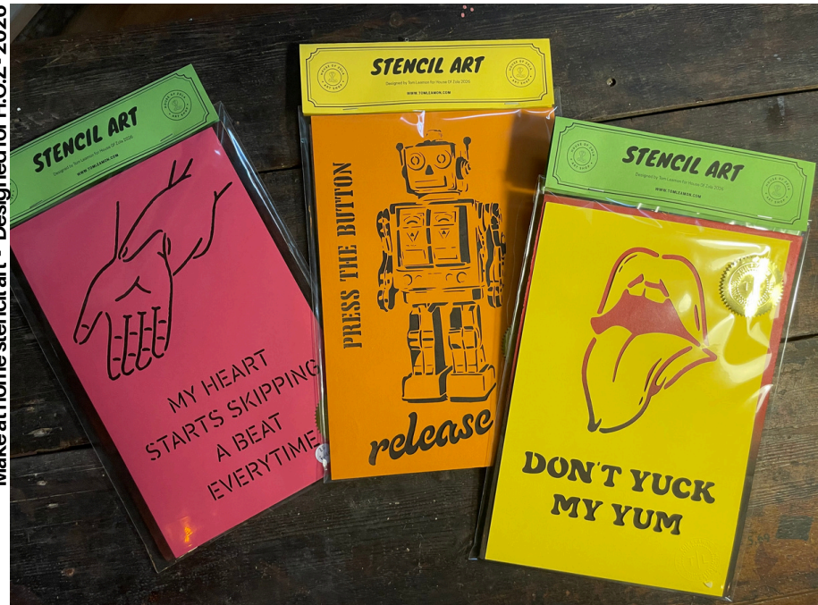
Make at home stencil art - Designed for H.O.Z - 2026

For a full list of products please contact via this link