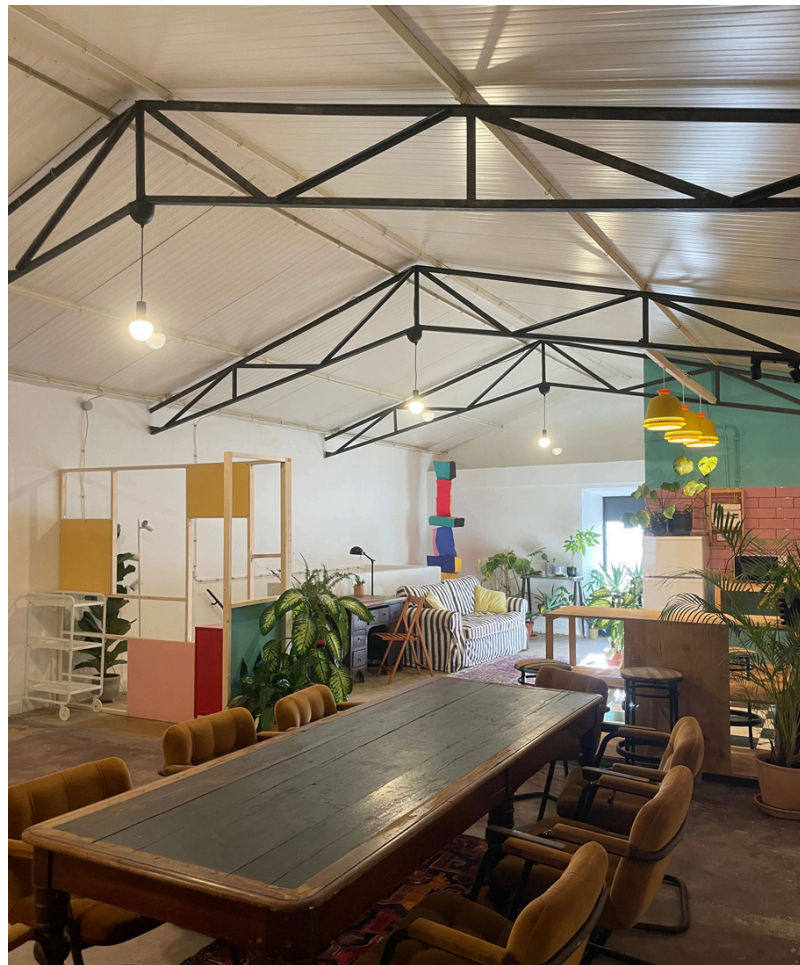
Communal area and studios - Designed & Built - 2026