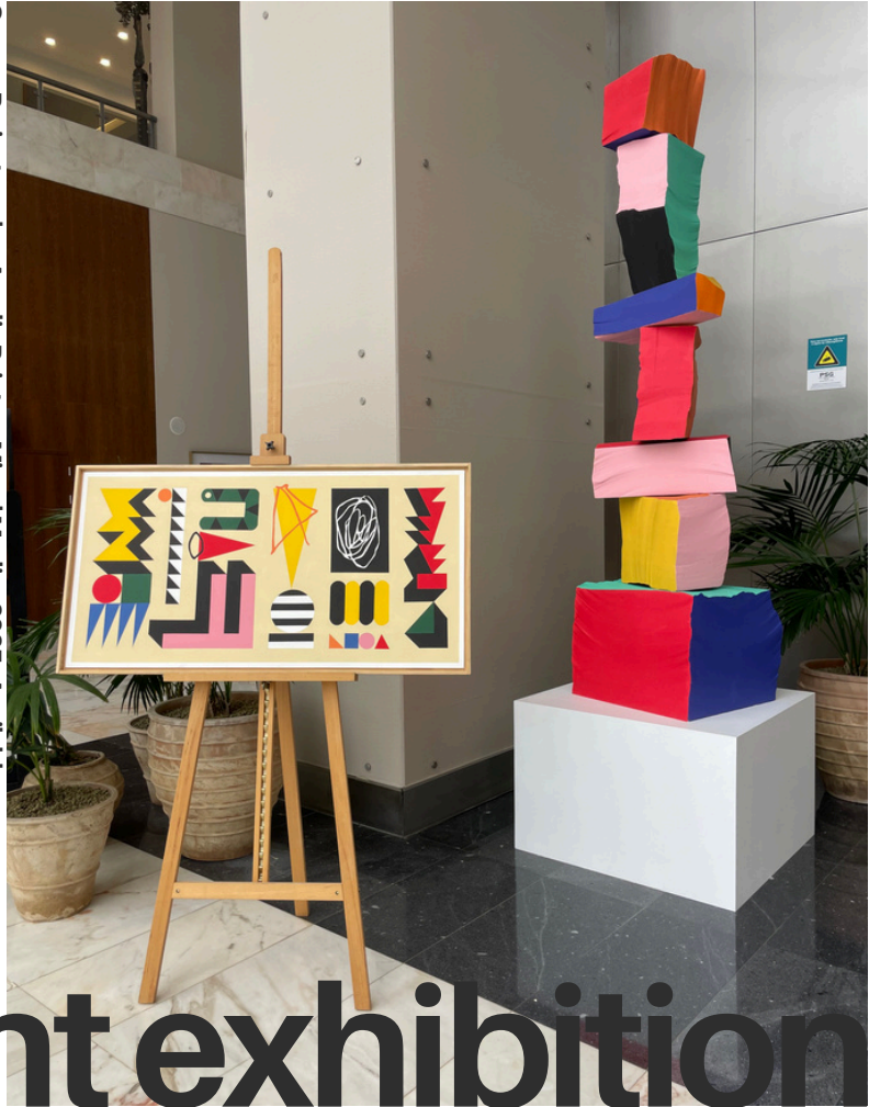
Omega Project works - Acrylic Paint on Mixed Media - 2025 - Available