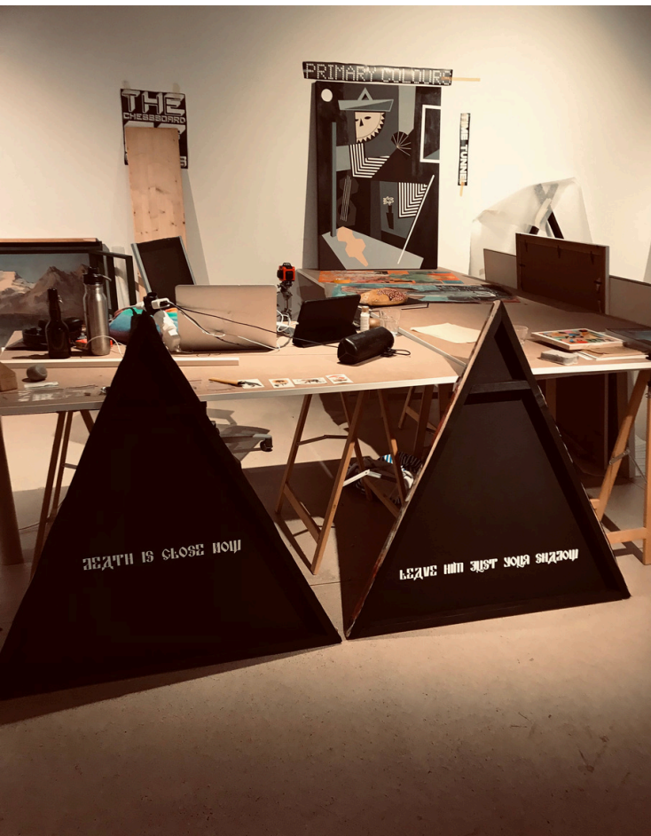
work in progress the mirror effect @ Art 1a - 2024