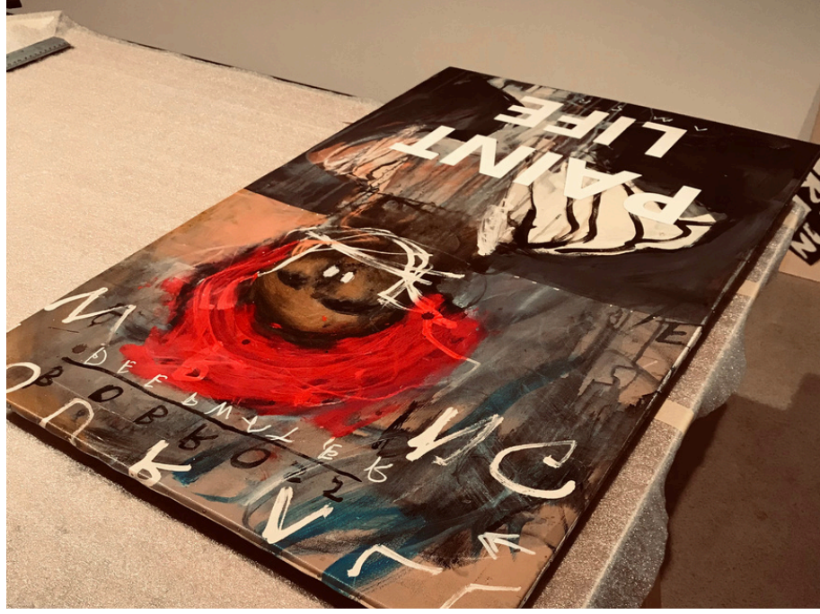
the bob ross effect in progress @ art 1a lucerne switzerland - 2024