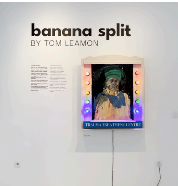
banana split exhibition - galeria augustine, Lisbon - 2023

If you find yourself reading this and have any questions I am more than happy to answer them.