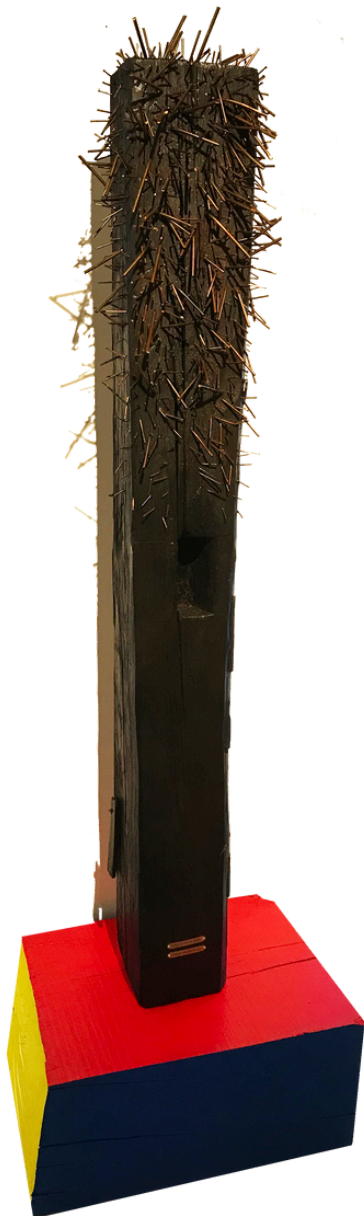
Former Weight Bearer | Antique Wood Beam, Nails & Varnish | 174x50x38cm