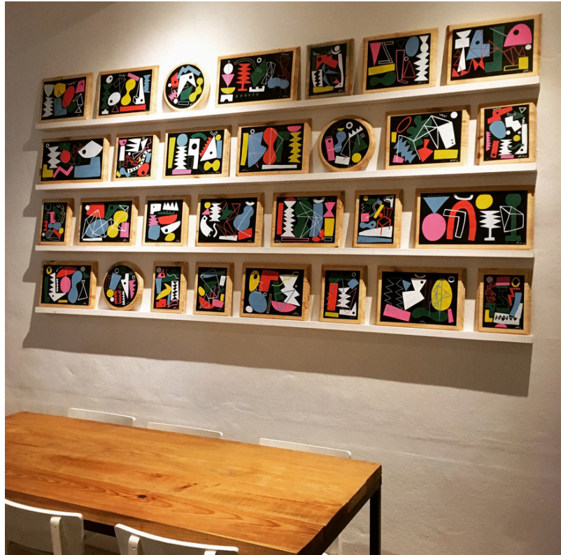
los locos restaurant faro - painting installation 2020