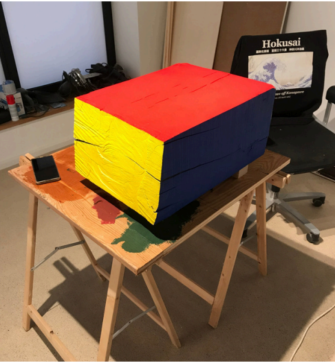
work in progress @ Art 1a - 2024