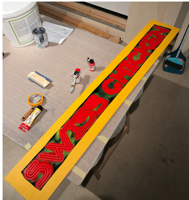
work in progress Swiss Chicken @ Art 1a - 2024