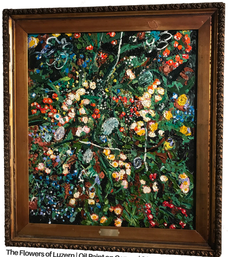
The Flowers of Luzern | Oil Paint on Canvas | 83x75cm