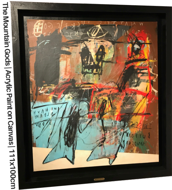
The Mountain Gods | Acrylic Paint on Canvas | 111x110cm