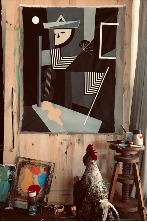
wunderkammer III @ estúdio yucca - 2024