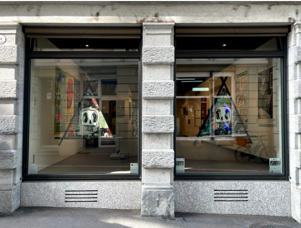
exterior photo the heart of switzerland @ art 1a- 2024