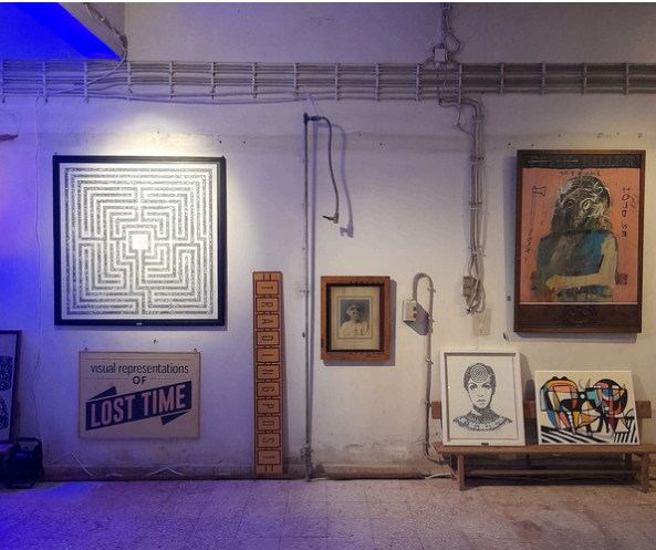
lavandaria pop-up exhibition space faro - 2023