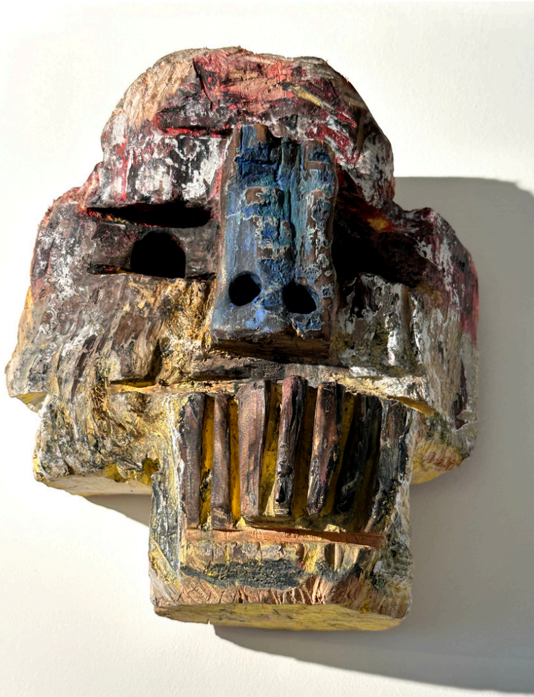
Fasnacht Mask Three | Wood Carved, Burnt & Painted | Approx 32x26cm