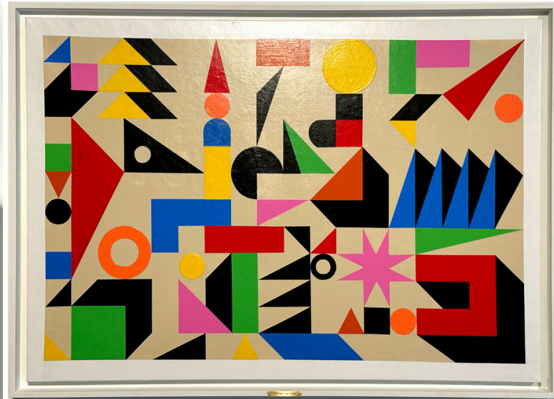
A Birds Eye View | Acrylic Paint on Canvas | 102x73cm

The current collection of works created for The Heart Of Switzerland exhibition cover a wide range of mediums. During the creation process I had freedom to play, reimagine old styles and develop new ones without inhibition.