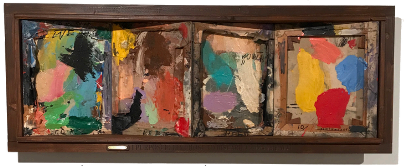
The Process | Acrylic Paint on Canvas | 133x51cm