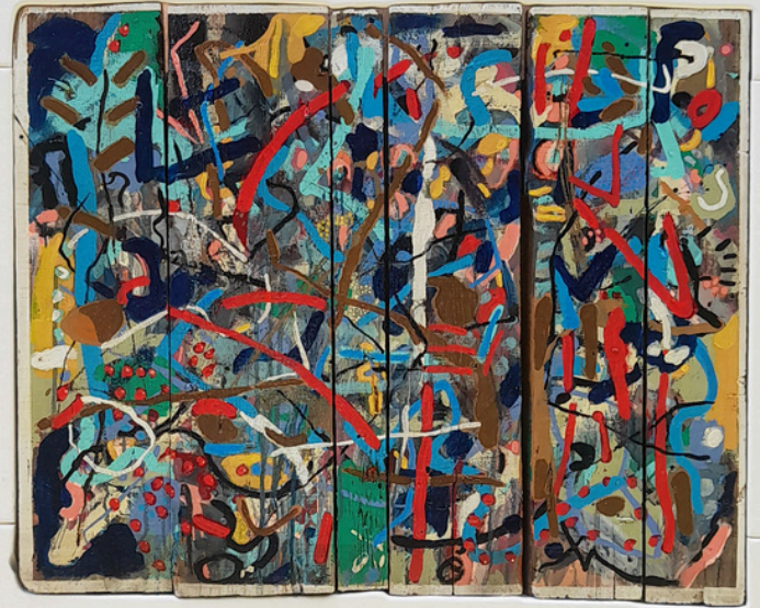
caveman - painted in the wilds of portugal - 2020