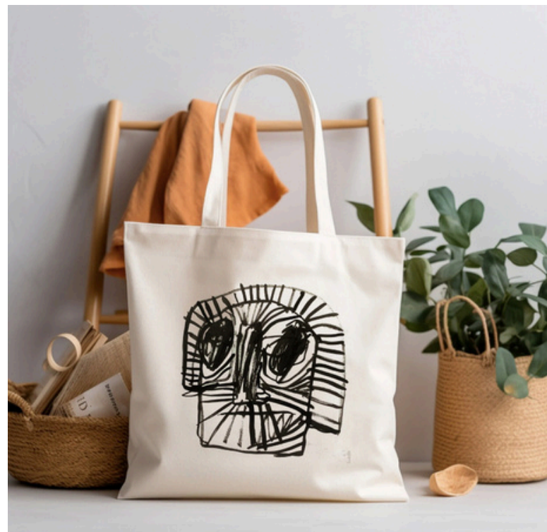
photo - the master tote

It has been my longterm intention to turn components of my practice into products. I am starting with a collection of white t-shirts and and tote bags. More designs to follow. For information please send an email to mail@tomleamon.com