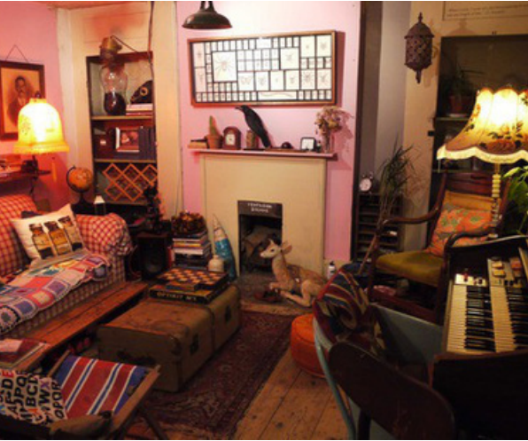
studio 180 - the lounge - 2012