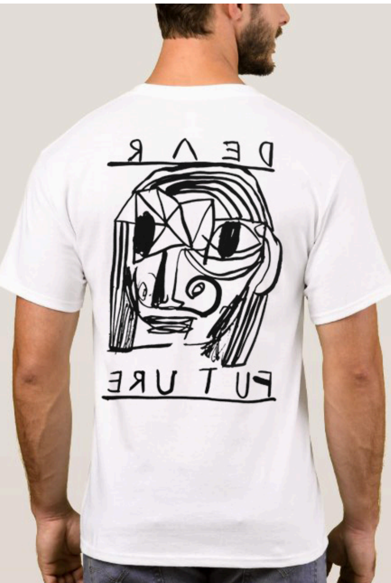
photo - dear future t-shirt