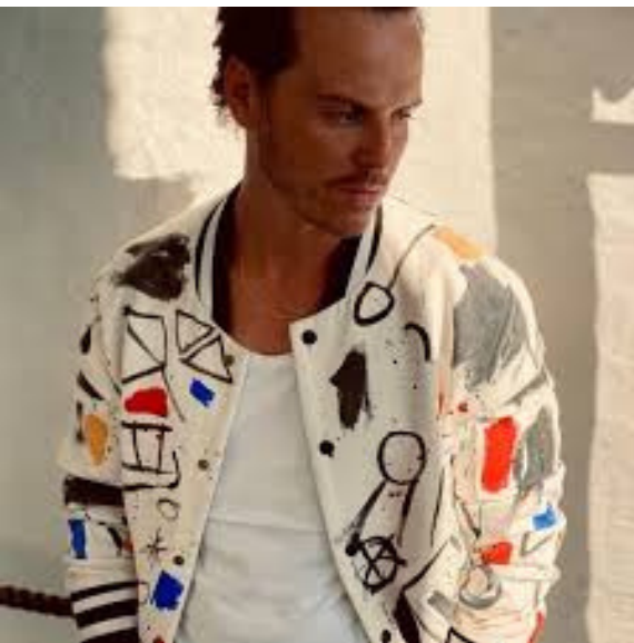
hand painted jacket collaboration - teatum jones - 2017

If you find yourself reading this and have any questions I am more than happy to answer them.