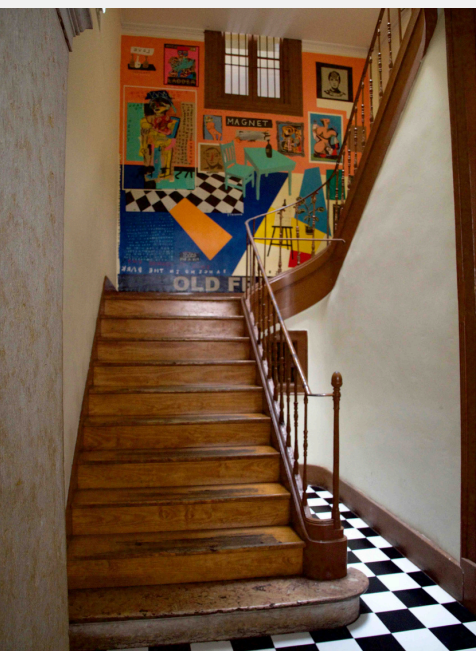
mural @ casa indipendente - 2018

If you find yourself reading this and have any questions I am more than happy to answer them.