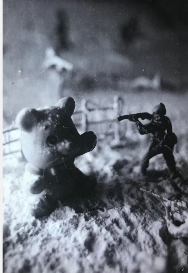
the innocence of war - staged photograph - 1999