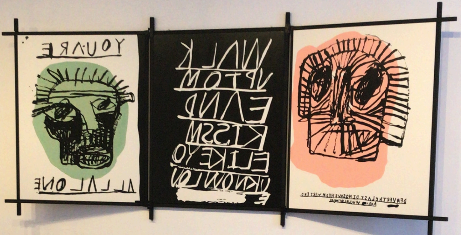
In Need Of A Little Tenderness | 2023 | Acrylic Paint on Canvas | Available