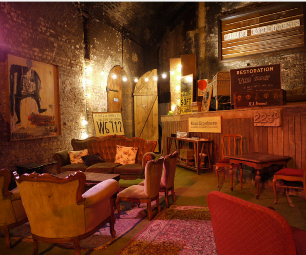
gallery 223 - 2013